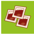
tea & coffee grounds