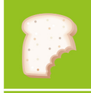
bread & pastries