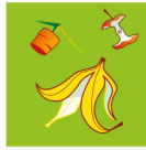
fruit & vegetables