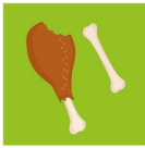
meat & bones