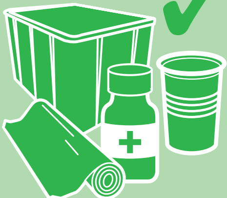
plastic boxes, bottles, trays, cups & wrap