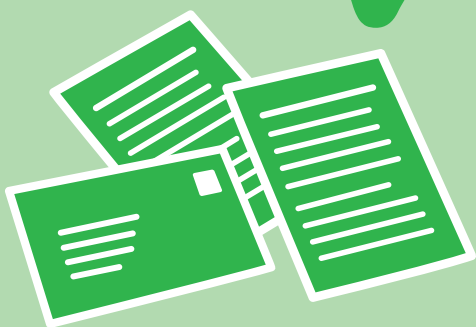
white paper & envelopes